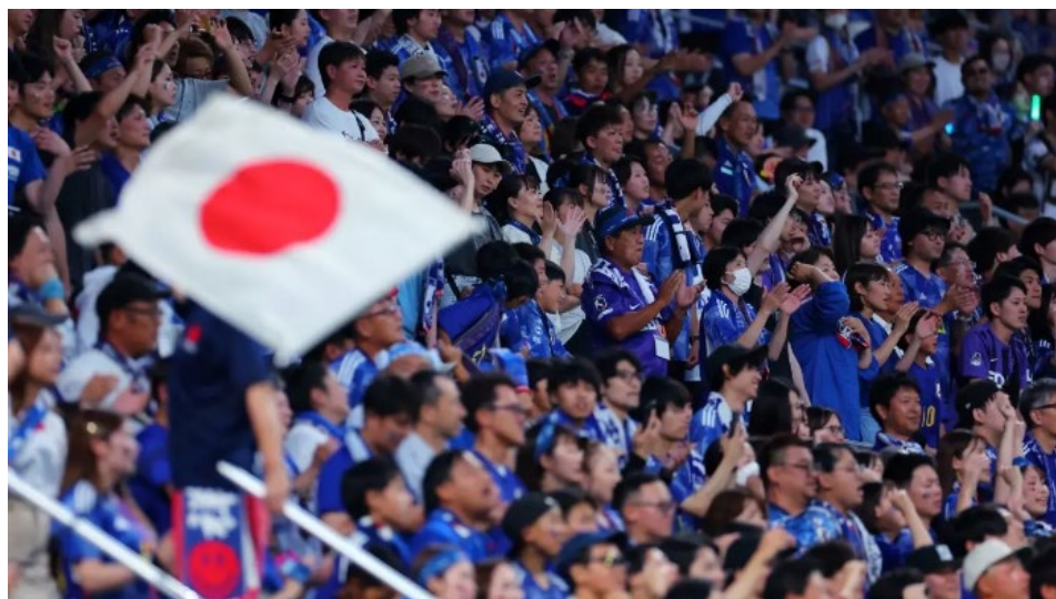
Japan v Syria at the 2026 FIFA World Cup Asian Qualifiers

The first half for Asia hasn't been bad. Our Japan rate hike call has worked well, and we have recently beefed it up. We have also had to crystallise an upside risk for our Australian rates, forecasts which we flagged earlier this year. On the downside, we were too pessimistic about the Philippine inflation outlook