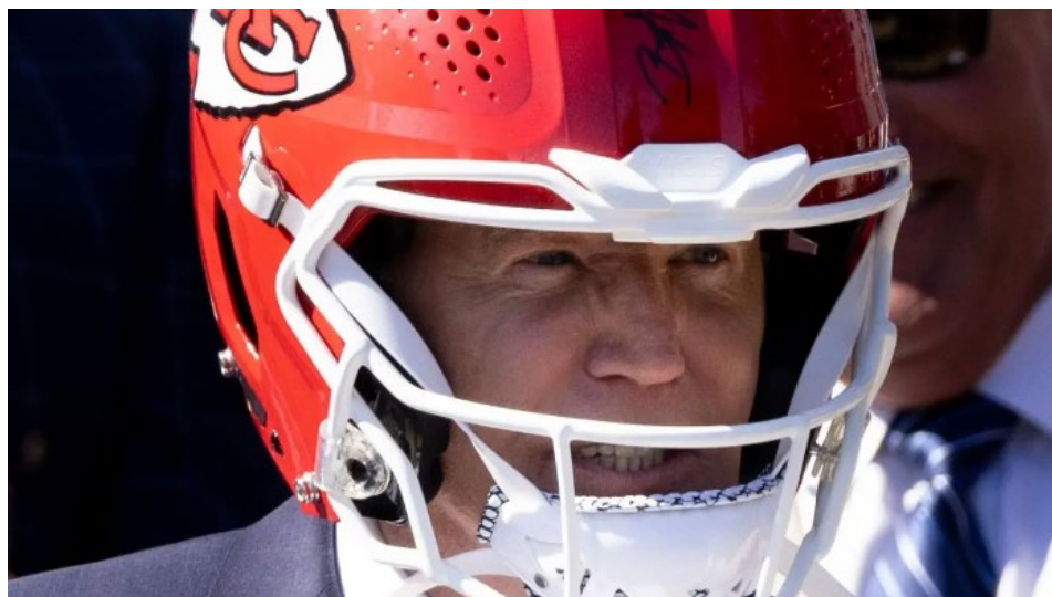
US President Joe Biden wears a Kansas City Chiefs helmet after the team's Super Bowl win

First, the important bit: we still like lower rates, steeper curves and wider eurozone spreads for 2024. But now for the US election drama! If Biden pulls out, Treasuries rally (yields fall). But if Trump wins, Treasuries sell off (yields rise), certainly eventually. But, for unobvious and contrarian reasons