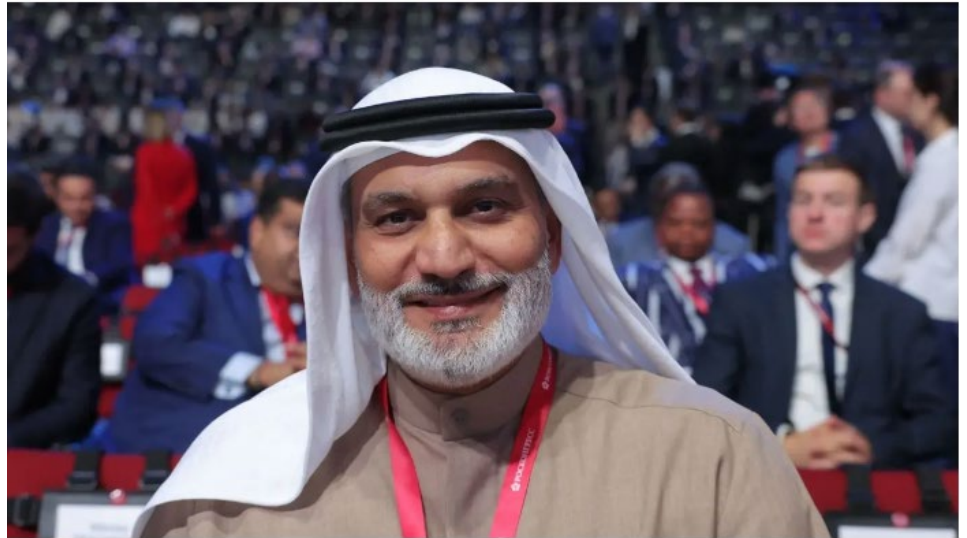
OPEC Secretary General Haitham al-Ghais in Russia earlier this year

We were right at the start of the year about oil prices tightening and OPEC+ supply cuts are continuing to support the market. Gas storage levels came in much better than we expected. And gold, as we thought, has already touched record highs