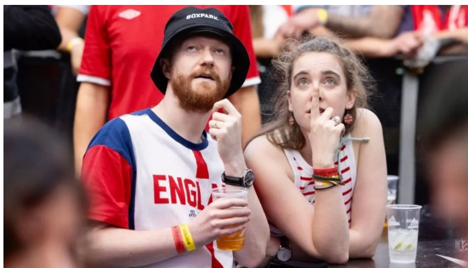
Nervous England fans waiting for a goal and also for a Bank of England rate cut

We mostly got it right on inflation. For the rest of the year, we're expecting the first Bank of England rate cut in August. In fact, we think further progress on services inflation should unlock three cuts in total this year