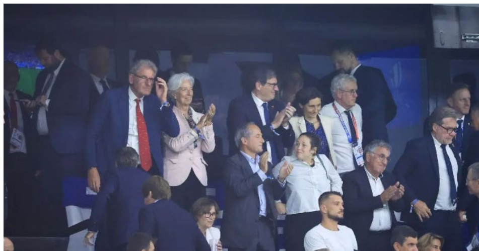
ECB President, Christine Lagarde with someone who looks very like the Fed's Jay Powell. But isn't.

We thought at the start of the year that there'd have been more rate cuts from the Federal Reserve by now. We still think things will really get going in September