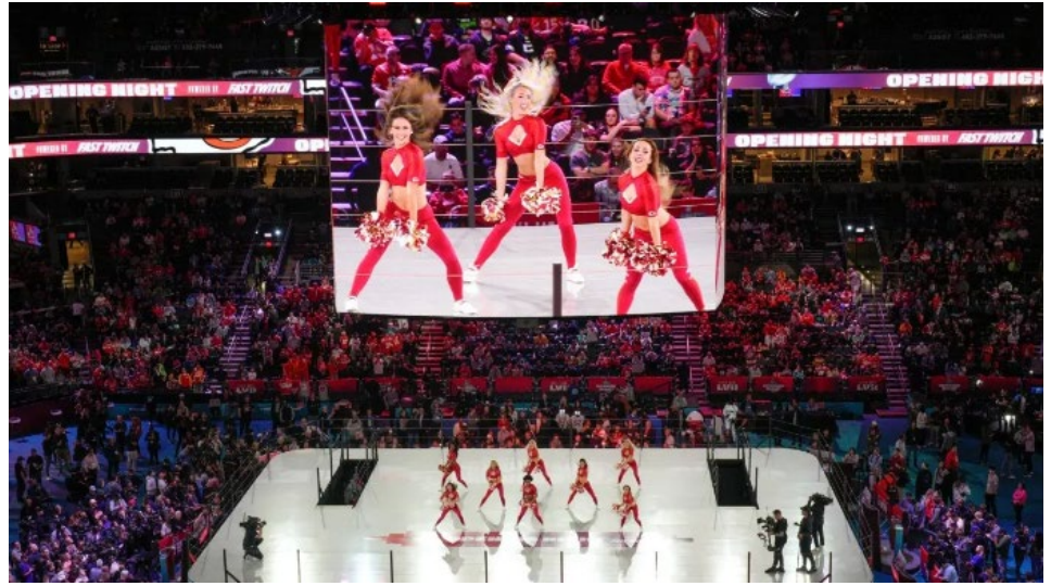
There's been a lot to cheer about in the US economy but things aren't looking quite so energetic now

The US economy has slowed as we suspected it would, but inflation and the jobs market have been more resilient. That's required the Federal Reserve to keep monetary policy tighter for longer. However the consumer is cooling, unemployment is rising and inflation is showing signs of moderating; we're expecting the first rate cut in September