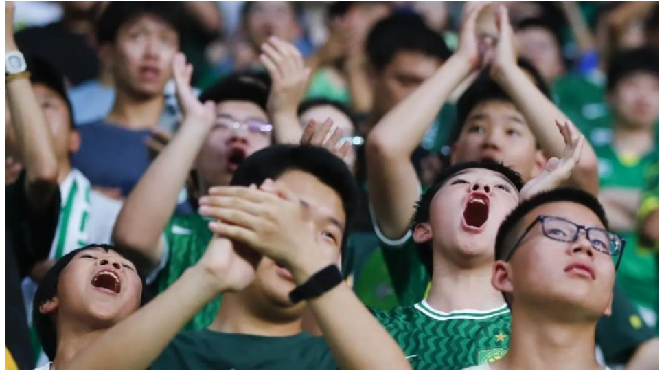
There are as many ups and downs for Beijing Guoan football supporters as there are for the Chinese economy