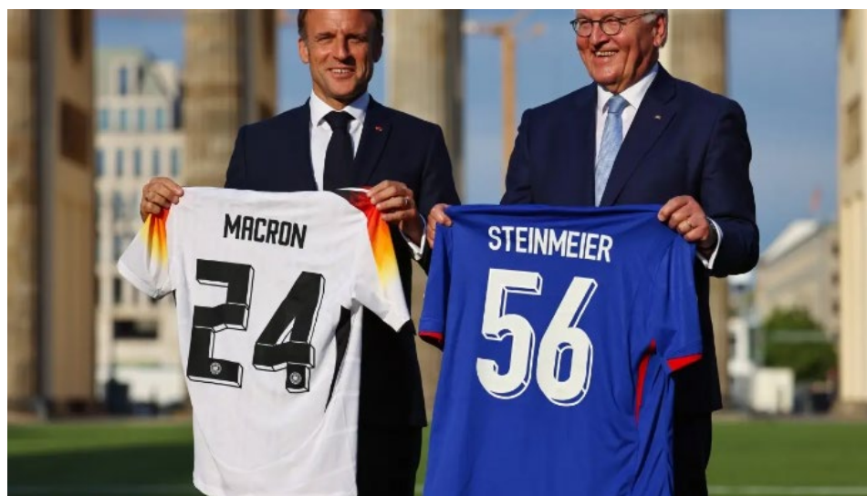
France's Emmanuel Macron and the German President, Frank-Walter Steinmeier, before the start of the Euros

Any sports commentator would tell you that Germany, France and Italy need to up their game to get a decent end result. Not all is lost, and we can't rule out pleasant surprises