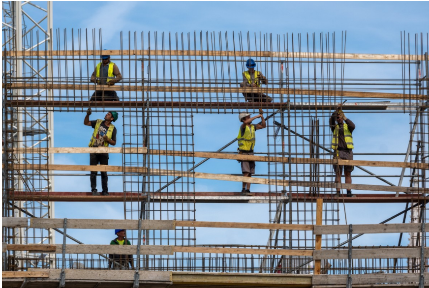
Workers at a construction site in Budapest, Hungary

Hungary's recent labour market data shows a seasonal improvement, resulting in a record-high employment rate. The situation for employers is growing hotter as wage expectations remain high, but the economy struggles to thrive