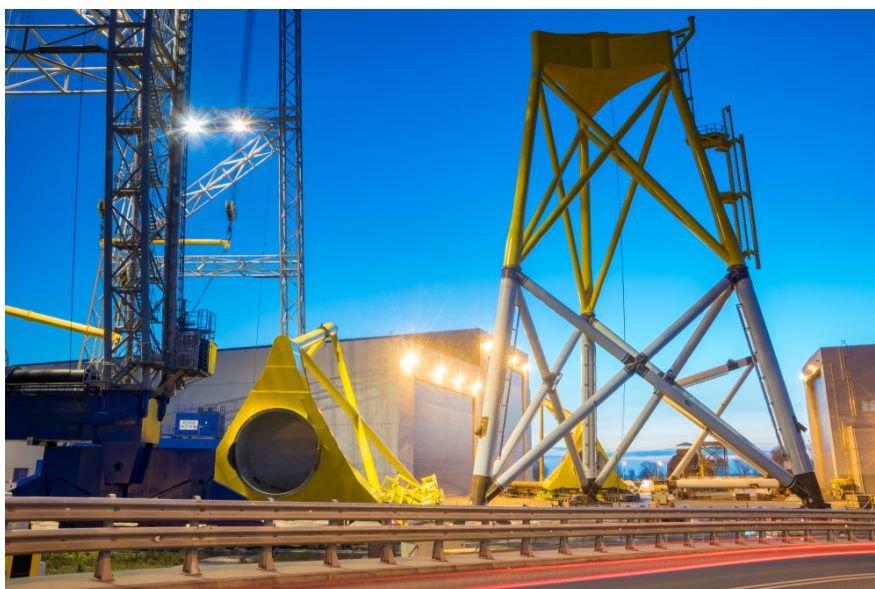
Wind power plant factory, Szczecin, Poland

Supply problems are dragging on industrial production. Strong demand is allowing higher costs to be passed on in the prices of finished goods