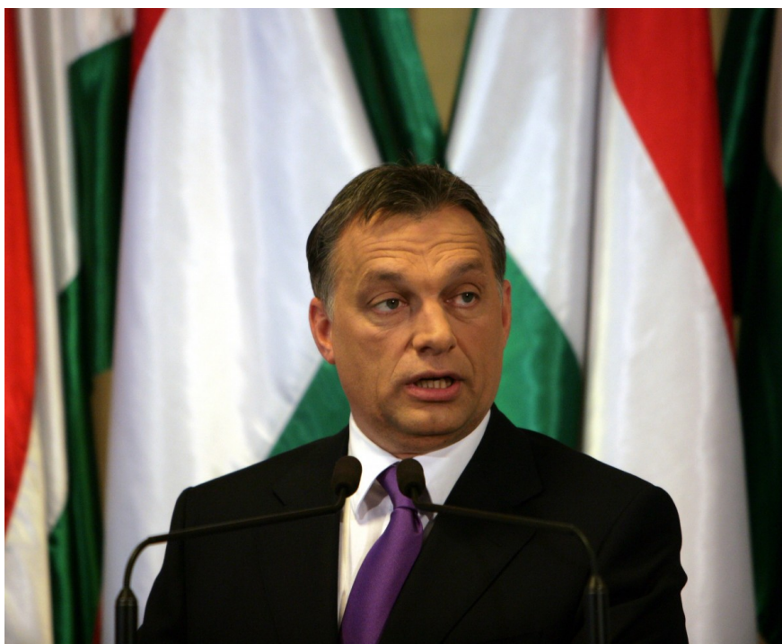
Viktor Orbán, Prime Minister of Hungary

Despite the high turnover, which should have been a glimpse of hope for the opposition, Fidesz-KDNP wins by a two-thirds majority, for the third time in a row