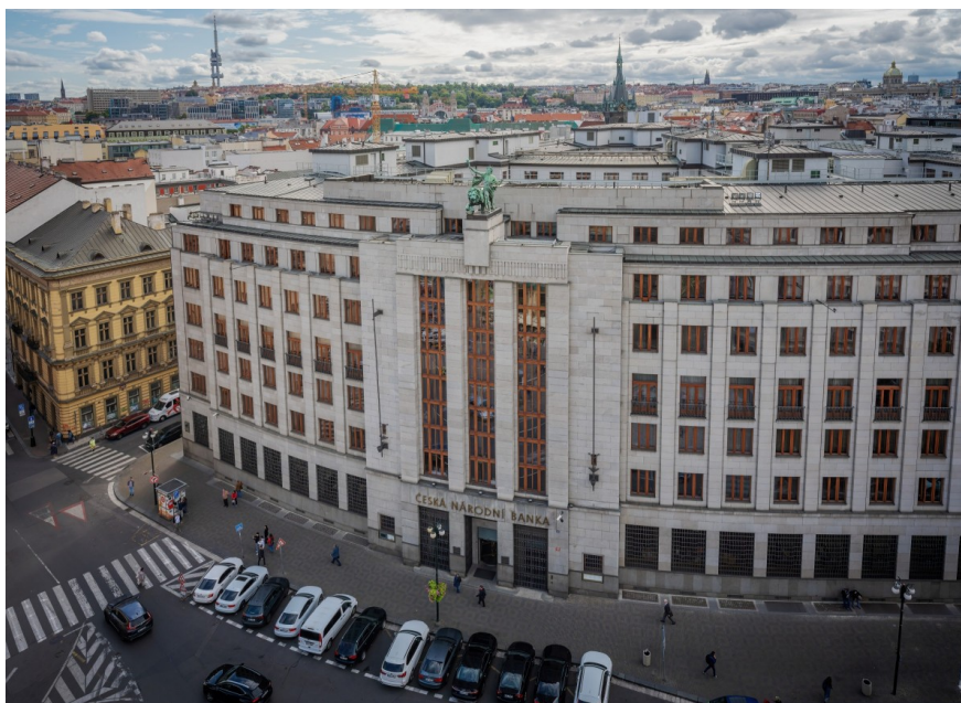
The Czech National Bank headquarters in Prague, Czech Republic

Czech policymakers kept rates unchanged at 3.5% in a unanimous vote, citing elevated core inflation, persistent price pressures in the service sector, and upbeat wage gains. All options remain open when looking ahead, with both inflationary and deflationary risks under consideration