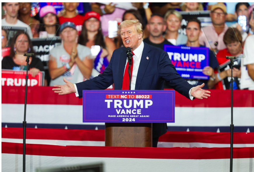
Republican nominee, Donald Trump, at a rally in North Carolina on Wednesday

A strong dollar has wiped off some $8.4bn of US profits in the first quarter, according to analysis by Kyriba Corp. And traders are also digesting recent Donald Trump comments that the US has a 'big currency problem'. We have some answers to key market questions and what it could mean for the dollar