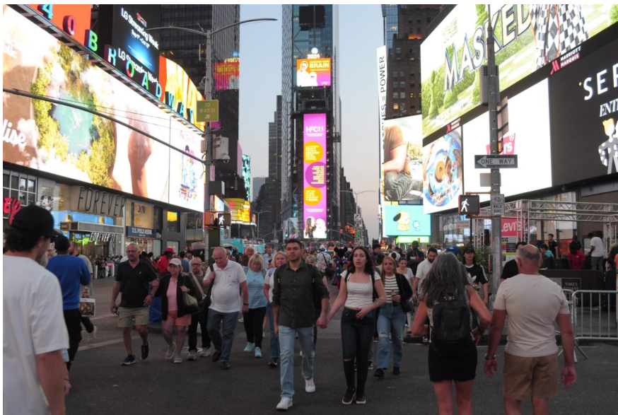
People in Times Square, New York

The US economy only added 12,000 jobs in October, but this was depressed by strike action and hurricane disruption. Nonetheless, the trend in hiring is obviously slowing and with the inflation backdrop looking less threatening, the Federal Reserve clearly has scope to move policy closer to neutral