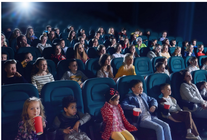
Entertainment helped boost US services over the summer

The US service sector ISM surprised to the upside in August and while not at very high levels is consistent with US growth accelerating in the third quarter. There are doubts as to how sustainable this will be, but the rise in the inflation component will keep hawks wary even if they do indeed go with the majority and vote for a pause on rate hikes in two weeks