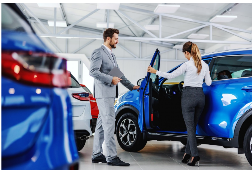
Strong auto sales contributed to robust September retail sales

A robust US retail sales report for September plus upward revisions to August's report reinforce the view that the US economy likely expanded at a 4% annualised rate in the third quarter. Headwinds are set to intensify, but for now the US consumer continues to defy the odds