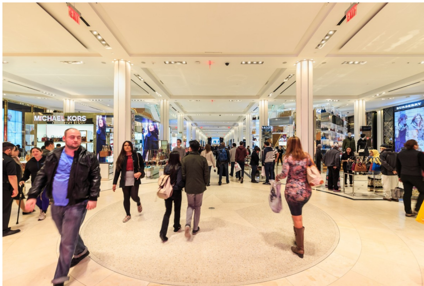
US retail sales rose 0.7% month-on-month in March, which was above expectations

Remarkably strong retail sales numbers for March contradict somewhat weaker survey and credit card spending evidence, but with jobs, inflation and activity all beating expectations the Federal Reserve is in no position to carry through with interest rate cuts anytime soon