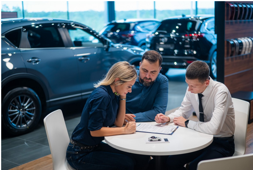
US consumer credit rose in June, led by car loans

Consumer credit grew more than expected in June, led by car loans, but credit card spending contracted as borrowing costs hit record highs. With banks increasingly reluctant to finance consumer credit and with consumer spending responsible for two-thirds of economic activity, consumption expenditure looks set to come under intensifying pressure