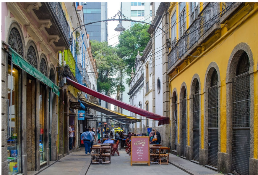
Rio de Janeiro, Brazil. Current risks to the real are largely political, whether at home or abroad

Latin currencies continue to be buoyed by interest in the carry trade, to which Fed rate cuts, more liquidity and low volatility should all be conducive. The main risks to something like the Brazilian real remain political, whether Washington takes a greater interest in Brazilian free speech or President Lula's pre-election spending plans