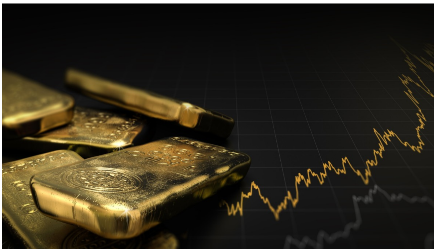
Gold has staged a historic rally, doubling in less than two years

December futures in New York, the most active contract, surpassed $4,000 for the first time as the US federal government shutdown dragged on into its second week