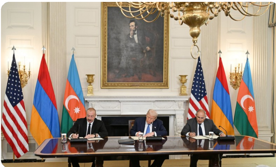
Azerbaijani President Ilham Aliyev, left, and Armenia's Nikol Pashinyan sign peace agreement in front of US President Donald Trump

CIS-4 economies remain resilient amid global headwinds. Armenia and Azerbaijan benefit from expected easing in regional foreign policy risks, while Kazakhstan and Uzbekistan enjoy above-expected growth in activity. Monetary policy easing is paused everywhere except Azerbaijan, as inflation risks persist