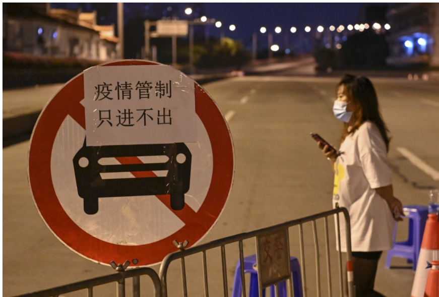
Movement has been restricted in parts of Guangdong province in China because of a rise in Covid cases

The small number of Covid cases in China's Guangdong province is disrupting production and shipments. Supply chains are once again being hit. If Covid can't be contained before the summer holidays, it will also hurt China's retail sales