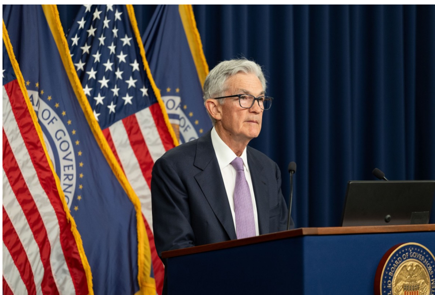
Fed Chair Jerome Powell at the press conference following the 50bp rate cut, which marks the first rate cut in four years

The US Federal Reserve wants to get to neutral quickly as it increasingly prioritises potential job weakness at a time when it is more comfortable with the inflation backdrop. We look for a further 150bp of cuts by next summer, but the risks are skewed towards the central bank doing more