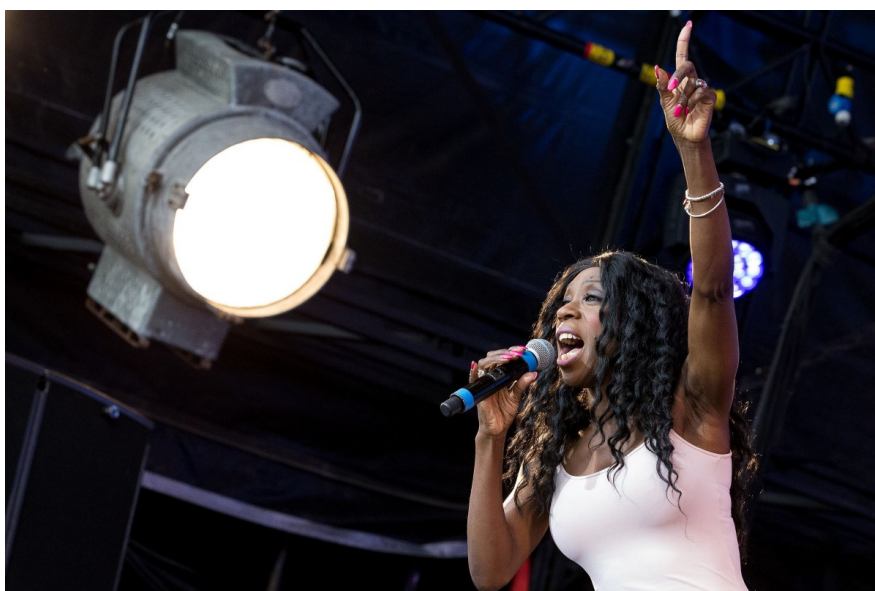
Heather Small of M People moved on up in 1993

Stronger-than-expected growth in China, de-escalating tensions in the Middle East and the signing of the Sino-American phase-one deal should all pave the way for a good week for risk sentiment. In FX, the New Zealand dollar may lead the pack and move on up, as M People might have put it, while JPY looks set to break the 110 level